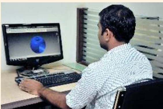
Finite element analysis