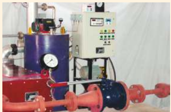
Microfinish research and development facilities include high temperature test loop to 480 °C (896 °F) at 15 bar pressure